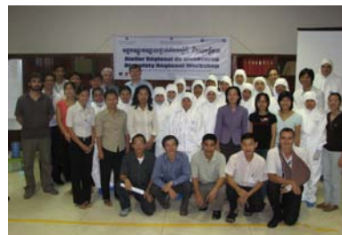
Regional training of Biosafety BSL2/BSL3, 13-15 February 2008, at the IP in Cambodia