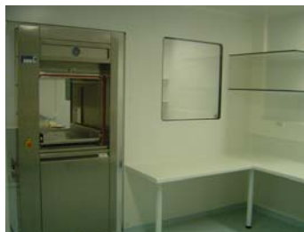
Double entry autoclave (interior of BSL3) Matachana/Europ-Continents, Cambodia and airlock staff entry room and airlock material entry room of BSL3 (Trespa partitions LSB, France)