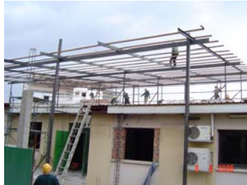
Heightening of the steel frame and the roof for the passage of the service shafts (DBD, Cambodia)