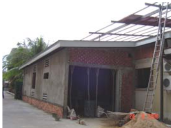
Construction of technical facilities of BSL3 (DBD) and Installation of cold group (CIAT/Comin Khmere)