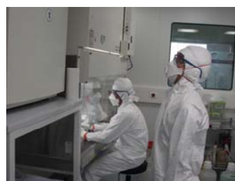
Avian Influenza Module of BSL3 and Animal house Module (A3) with insulating incubator