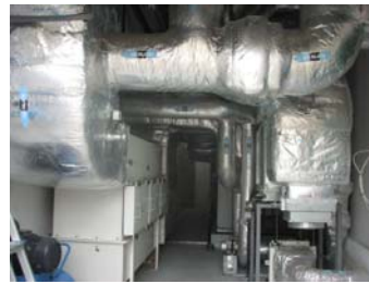
Interior of the technical facilities and Network of the ventilation shafts of BSL3 (Comin Khmere)